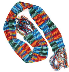
NP827 - Tie Dye Knitted Patchwork Scarf £10.00