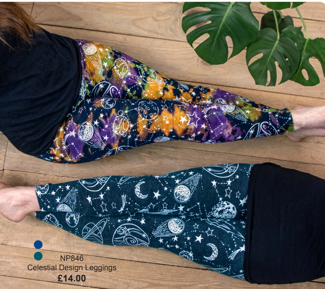
NP846 Celestial Design Leggings £14.00