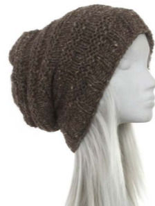
NP632 Slouch Beanies (Pack of 5) £18.00