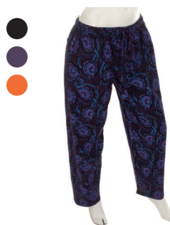
NP807 Cotton Straight Leg Trousers £12.00