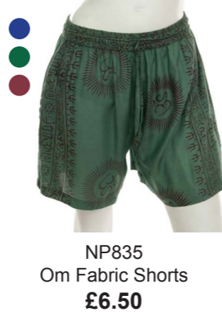
NP835 Om Fabric Shorts £6.50