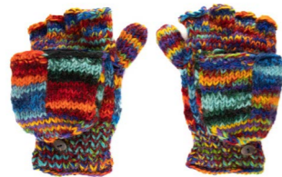
NP831 - Tie Dye Knitted Patchwork Hunter Gloves £5.65