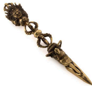
Daggers and Phurbas