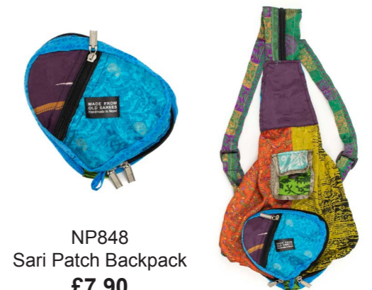
NP848 Sari Patch Backpack £7.90