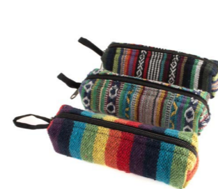
NP850 Reading Glasses Case £2.50