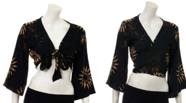
BA8037 - Wrap Top £10.00