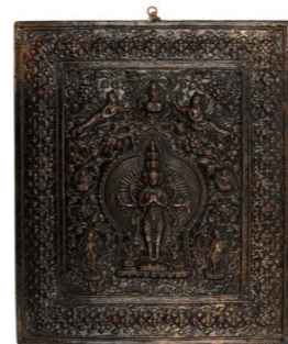
Metal Wall Hangings