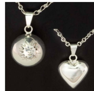
MEX420 - MEX423 Musical Ball Pendants from £4.15