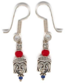
NP884 Buddha Earrings £2.50