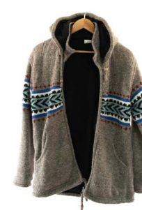
NP823 - Chevron Wool Hooded Jacket £40.00