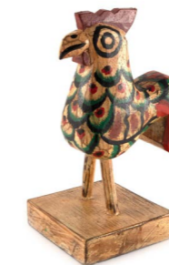
BA2203 Wooden Cockerel £4.15