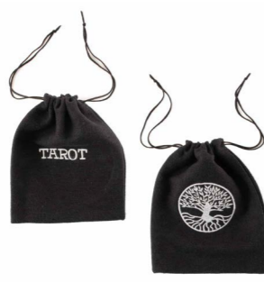
NP856 / NP857 Tarot / Tree of Life Pouch £2.75