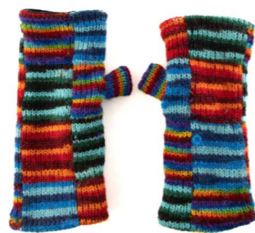
NP830 - Tie Dye Knitted Patchwork Tube Gloves £4.75