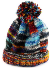
NP828 - Tie Dye Knitted Patchwork Bobble Hat £5.65