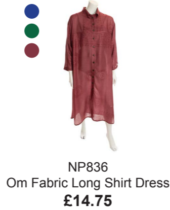
NP836 Om Fabric Long Shirt Dress £14.75