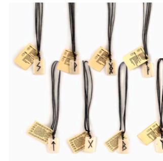
BA2197 Rune Pendants (set of 8) £6.00