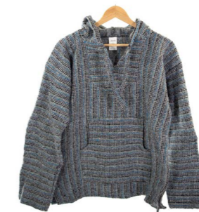
MTC1-FRB Jerga (Frosty Blue) £12.00