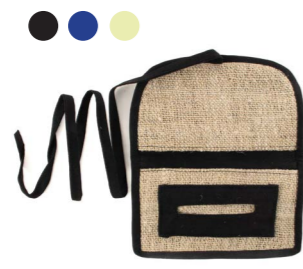
NP855 Hemp Smoking Pouch £3.75