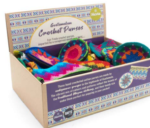
POS3 - Crochet Purses (quantity 50) £70.00