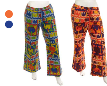
IN563 Abstract Elephant Trousers £15.00