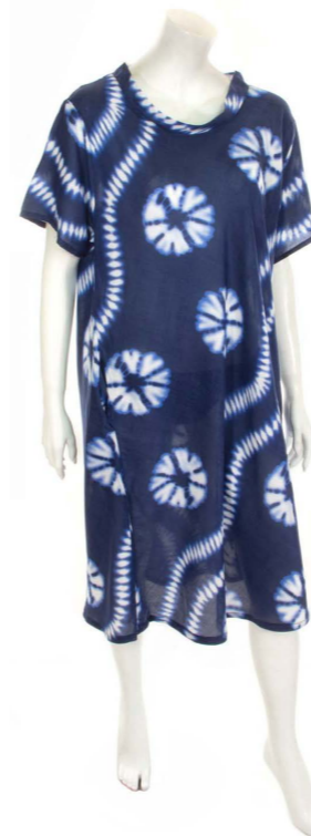
TH384 Tie Dye Dress £12.50