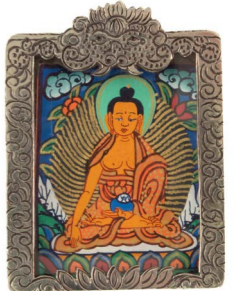
NP860 - Handpainted Thangka Pendant £25.00