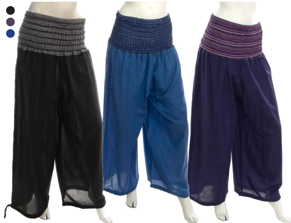
NP817 Flared Trousers £12.00