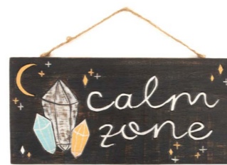
BA6086 Calm Zone Plaque £4.25