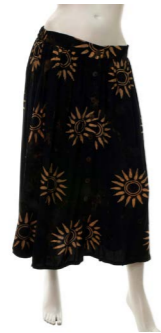
BA8034 Button Skirt £12.50