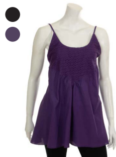
IN565 Cambric Top £11.50