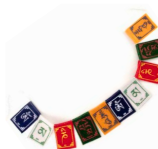
NP865 Mini Tibetan Prayer Flags £1.25