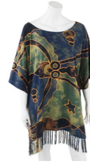
BTP2-ABS Short Batik Kaftan £11.00