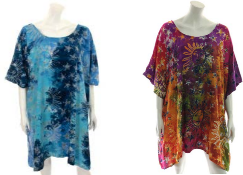
BA8017 - Short Kaftan £11.50