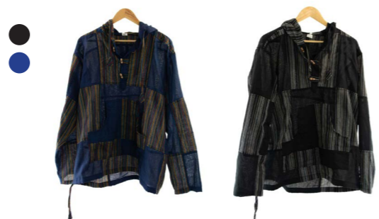
NP841 Stripy Cotton Patch Hoodie £15.25