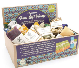
POS9 - Sari Gift Wrap (quantity 30) £50.00