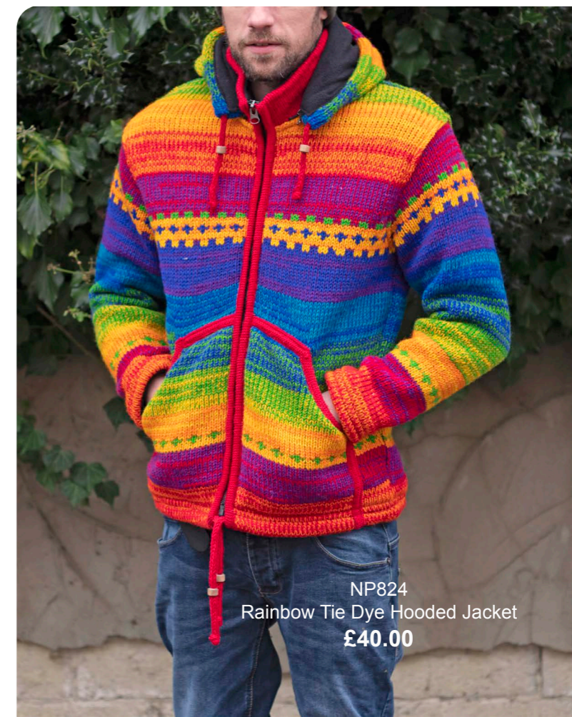
NP824 Rainbow Tie Dye Hooded Jacket £40.00