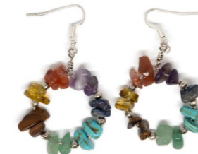
PE210 Chakra Stone Earrings £2.75