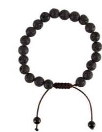
NP859 Lava Wrist Mallah £2.50