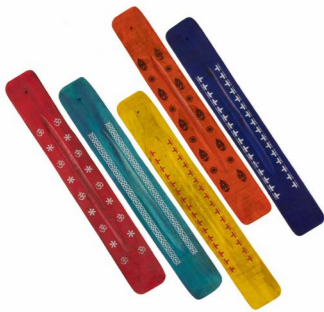
IN555 Ten Painted Ashcatchers £4.50