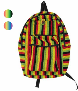
NP808 - Gheri Wayfarer Backpack £12.50

This is just a small selection of the many pieces of jewellery we have from around the world, all of which can be viewed on our website.