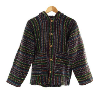
MTC5-MLT Button Baja (Multifleck) £15.00