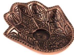
IN550 - Metal Hand of Fatima Incense Cone Burner £4.15