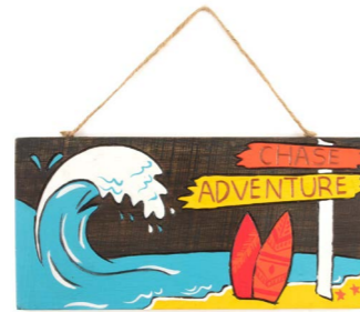
BA6085 Chase Adventure Plaque £4.25