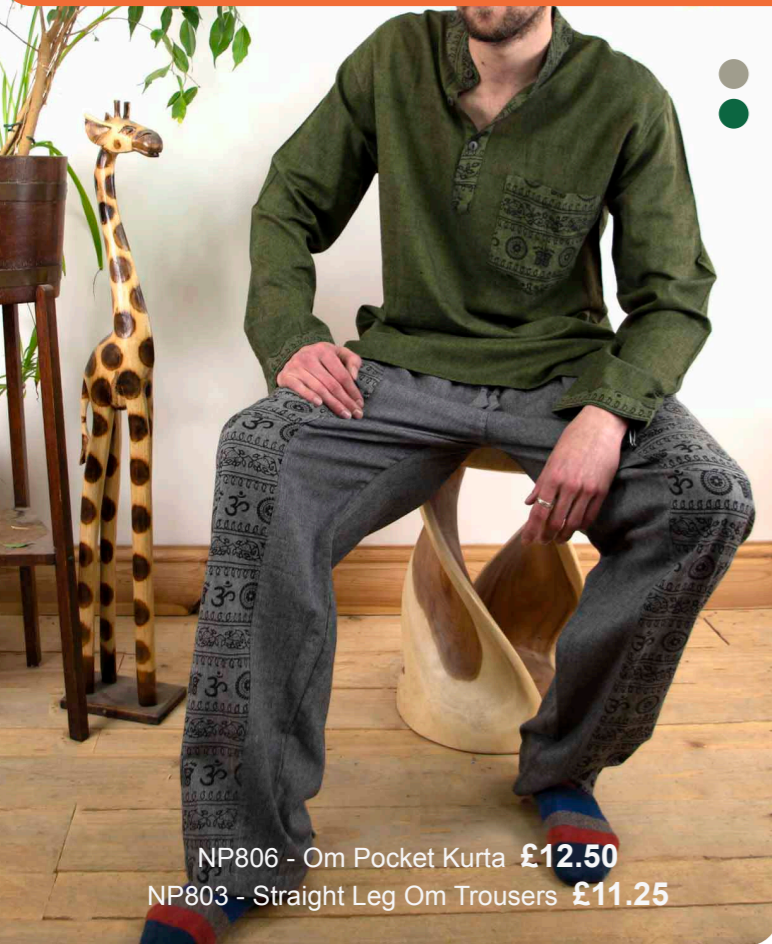
NP806 - Om Pocket Kurta £12.50 NP803 - Straight Leg Om Trousers £11.25