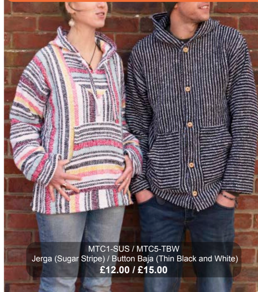
MTC1-SUS / MTC5-TBW Jerga (Sugar Stripe) / Button Baja (Thin Black and White) £12.00 / £15.00