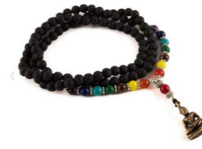
NP790 - Lava Bead and Chakra Buddha Mallah £23.00