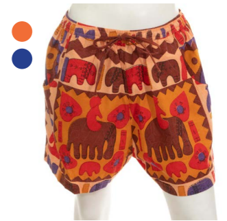
IN562 Abstract Elephant Shorts £10.00