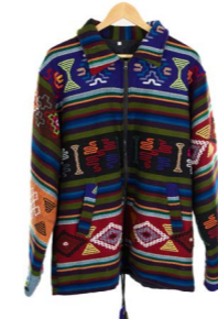
NP840 Bhutanese Fabric Jacket £50.00