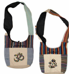
NP809 - Printed Cotton Shoulder Bag £10.00