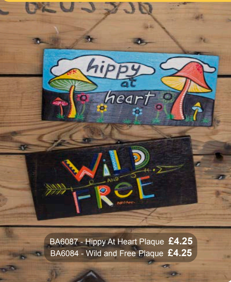
BA6087 - Hippy At Heart Plaque £4.25 BA6084 - Wild and Free Plaque £4.25