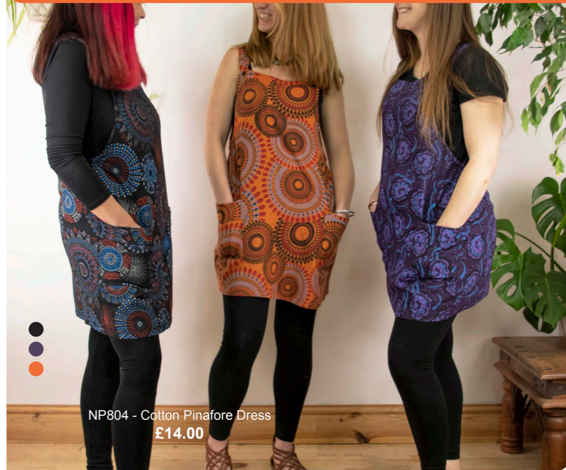
NP804 - Cotton Pinafore Dress £14.00