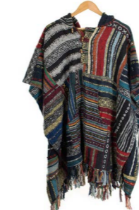
NP821 Long Patch Poncho £20.00