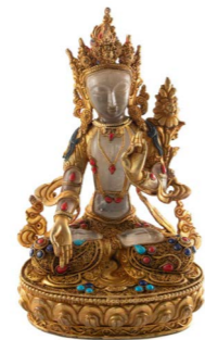
Copper, Brass and Crystal Statues