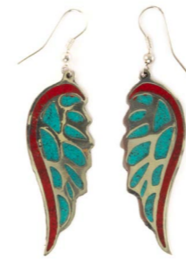
NP861 - Turquoise and Coral Wing Earrings £6.50