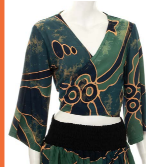
BA8051 - Wrap Top £10.00