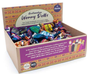
POS5 - Worry Dolls (quantity 120) £70.00