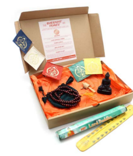
WPK003 - Wellbeing Buddhist Prayer Kit £8.00