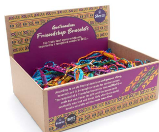
POS6 - Friendship Bracelets (quantity 240) £100.00