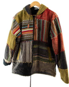
NP819 Stonewash Patch Jacket £27.50