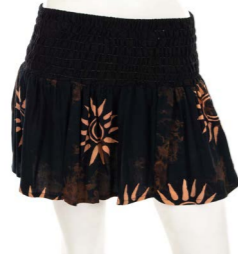
BA8047-BKS Mini Skirt £8.25