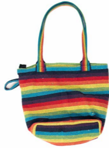
NP849 Gheri Small Beach Bag £6.75