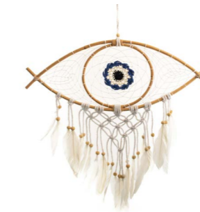
BA2196 Macrame Eye Hanging £7.00