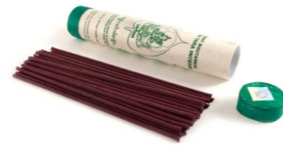
NP801 - Green Tara Ancient Bhutanese Incense £4.15