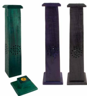
IN557 - Coloured Standing Smoke Box £4.15 each

We stock a vast array of incense, cones and resins. Our ranges include the ever popular Hari Darshan and NAG Satya, all of which are available to view online.