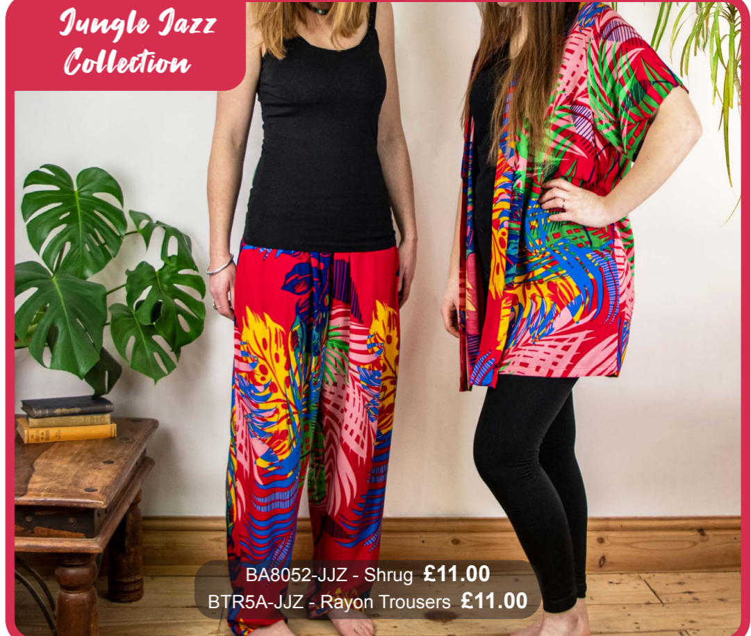
BA8052-JJZ - Shrug £11.00 BTR5A-JJZ - Rayon Trousers £11.00