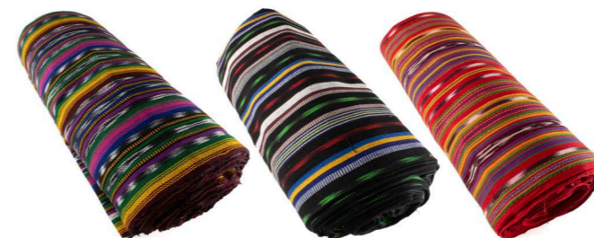
GU200 Handwoven Guatemalan Jasje Fabric £8.50 / yard