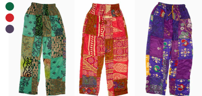
NP815 - Sari Patchwork Trousers £10.75

This collection features a variety of products made from discarded saris that are no longer used and would otherwise be wasted. Due to their recycled nature each item is unique!