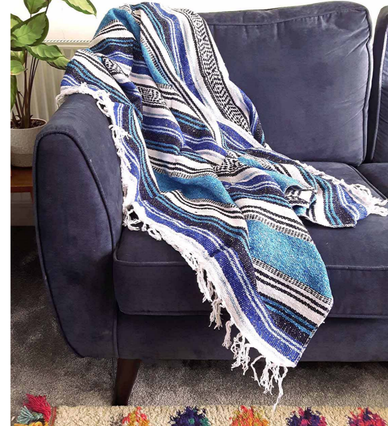
MX001-OBL - Falsa Blanket (Ocean Blue) £11.50