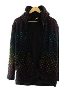
NP826 - Rainbow Dots Hooded Jacket £40.00