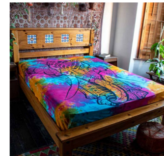
IN571 - Majestic Elephant Bedspread £12.50