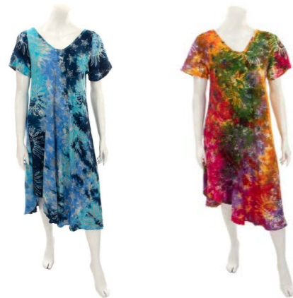
BA8054 - Dress £13.25