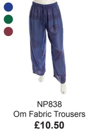
NP838 Om Fabric Trousers £10.50