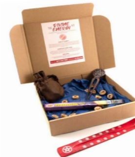
WPK005 - Wellbeing Divine Energy Kit £8.00