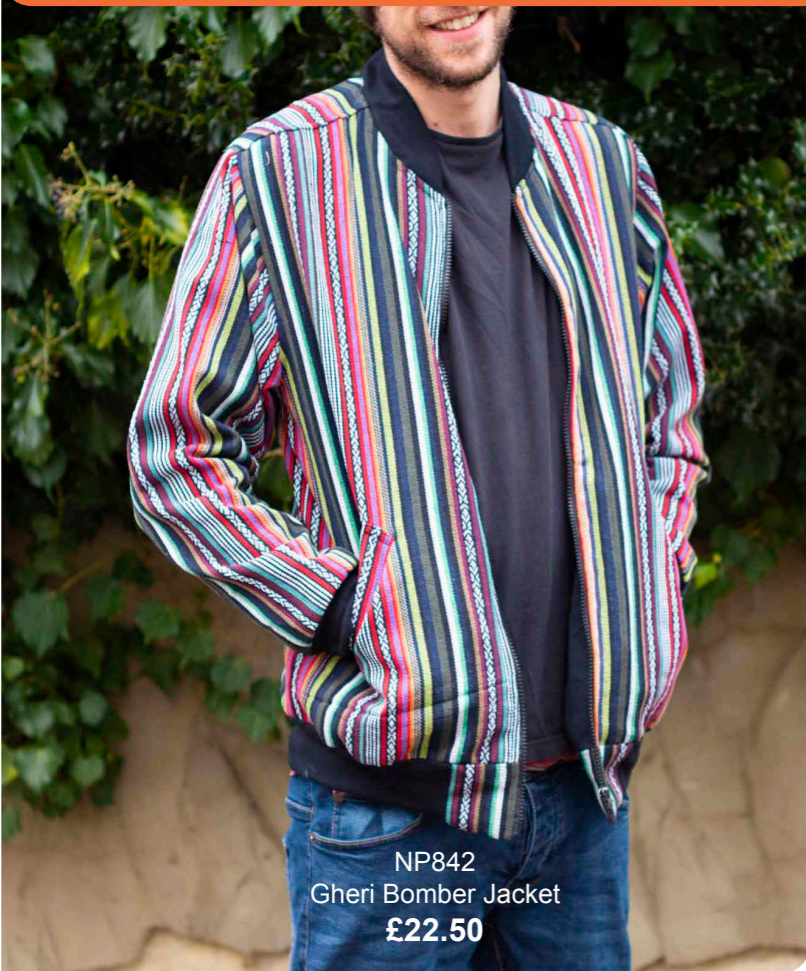
NP842 Gheri Bomber Jacket £22.50