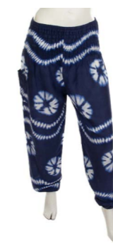
TH380 Tie Dye Harem Trousers £7.00