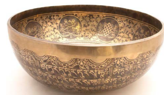
Singing Bowls, Lunar Bowls and Gongs