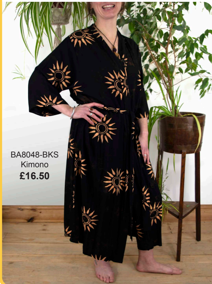
BA8048-BKS Kimono £16.50