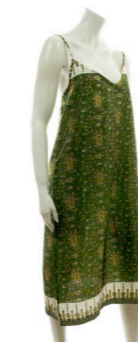
NP669 Sari Slip Dress £6.25