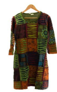
NP875 Ripped Cotton Dress £17.50