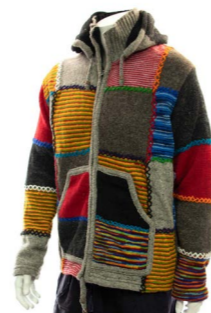
NP770 - Mountain Patch Jacket £40.00