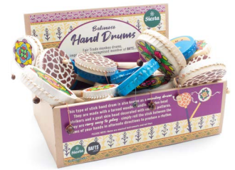
POS2 - Hand Drums (quantity 24) £40.00