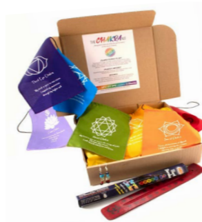
WPK006 - Wellbeing Chakra Kit £8.00