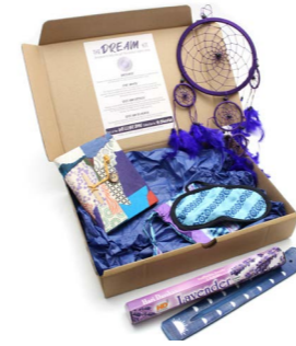
WPK001 - Wellbeing Dream Kit £8.00

Our Wellbeing Kits make ideal, ready-made gifts, presented in beautifully decorated boxes. They each feature a selection of handmade items for specific tastes and interests to help promote happiness and contentment.