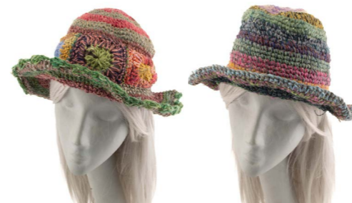
NP889 Hemp and Nettle Sun Hat with / without flower £5.00