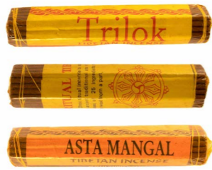
NP869 / NP870 / NP871 Nepalese Dhooop Incenses £0.60 each