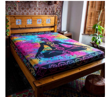
IN570 Chakra Man Bedspread £12.50