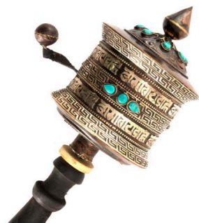
Antique Prayer Wheels