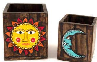
BA6078 - Sun and Moon Nesting Storage Boxes £5.50