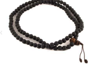
NP792 - Lava Beads and Rudraksha Mallah Beads £17.50