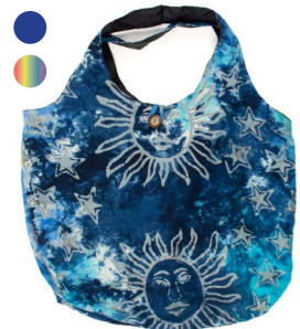
BA2167 Celestial Shopper Bag £6.00