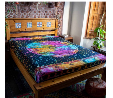
IN572 Multi Zodiac Bedspread £12.50