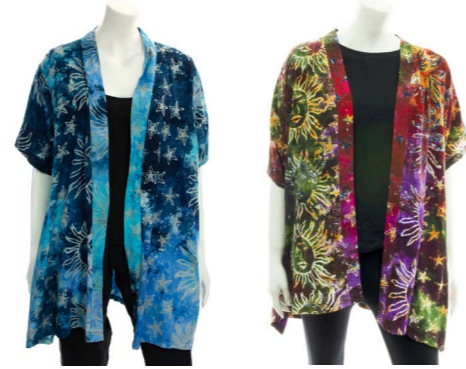
BA8026 - Shrug £11.00