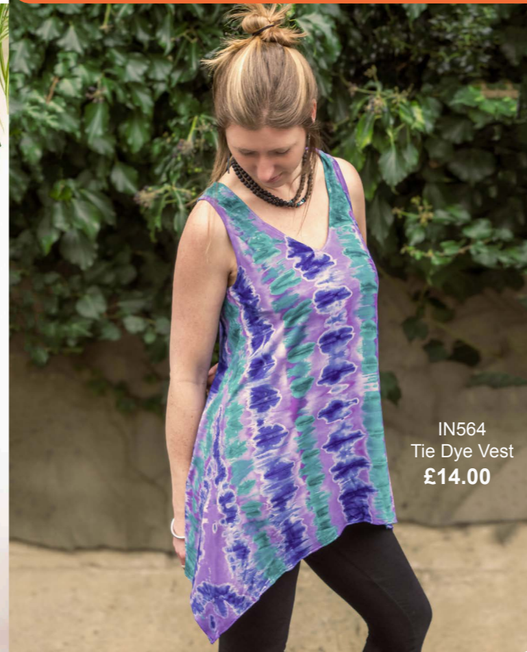
IN564 Tie Dye Vest £14.00