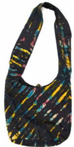
NP851 Tie Dye Shoulder Bag £7.50