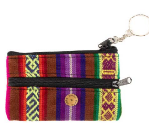
PE213 Double Zip Peruvian Purse £1.75