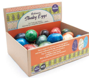
POS1 - Shaky Eggs (quantity 35) £50.00