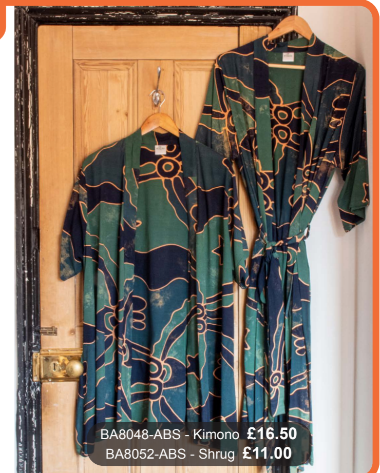
BA8048-ABS - Kimono £16.50 BA8052-ABS - Shrug £11.00