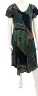
BA8053-ABS Bali Print Dress £13.25