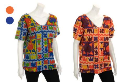
IN566 Abstract Elephant Top £10.00