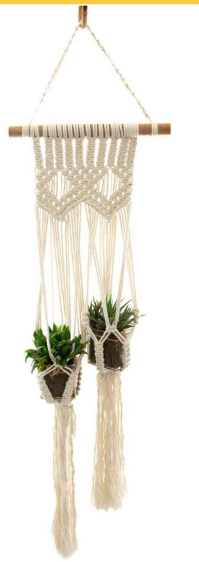
BA2202 - Double Wall Macrame Plant Hanger £10.00