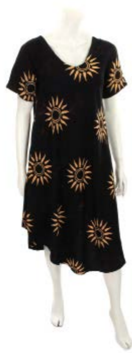
BA8053-BKS Bali Print Dress £13.25