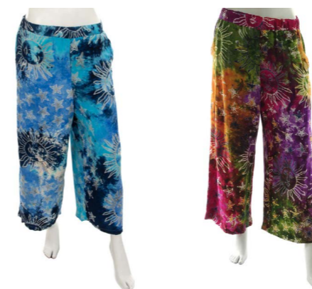
BA8020 - Cropped Trousers £11.50