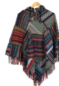
NP820 Triangle Patch Poncho £15.00