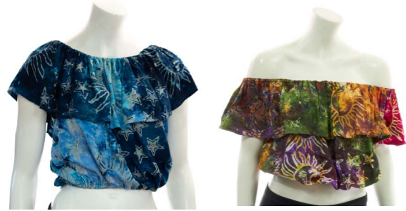
BA8027 - Layered Bardot Top £8.50