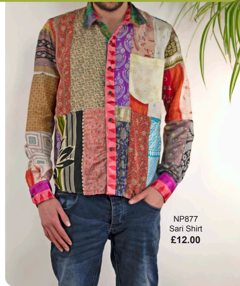
NP877 Sari Shirt £12.00