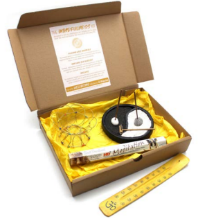
WPK004 - Wellbeing Mindfulness Kit £8.00