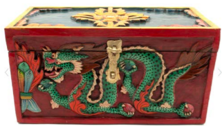
Tibetan Boxes and Chests