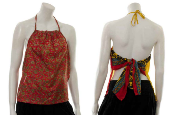
NP670 - Sari Knot Back Top £5.25