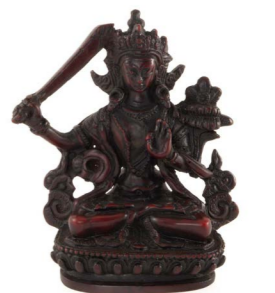
NP863 Manjushri Statue £7.50