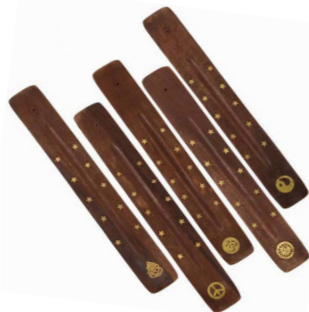
IN556 Ten Inlaid Ashcatchers £4.50