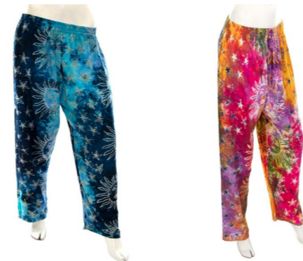
BTR5A - Trousers £11.00