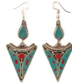
NP862 - Turquoise and Coral Triangle Earrings £6.50