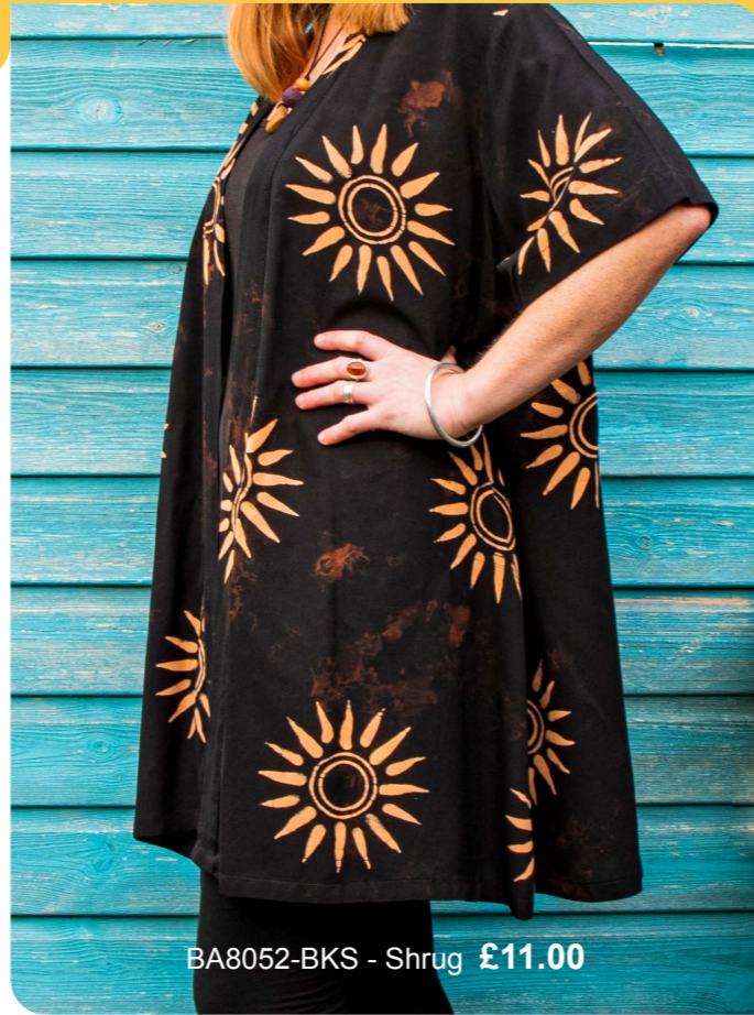
BA8052-BKS - Shrug £11.00