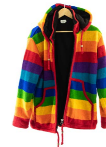
NP825 - Rainbow Stripes Hooded Jacket £40.00