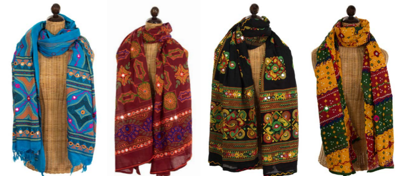
IN561 - Indian Summer Scarves £9.50