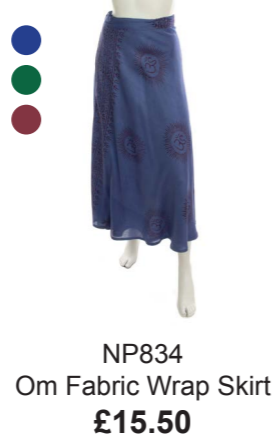
NP834 Om Fabric Wrap Skirt £15.50