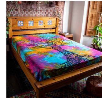
IN569 Celtic Tree Bedspread £12.50