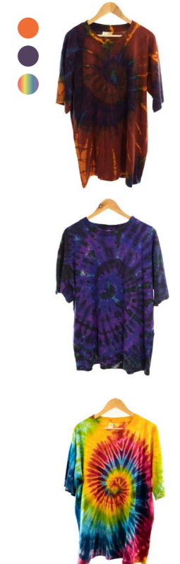
NP818 Spiral Tie Dye T-Shirt £7.75