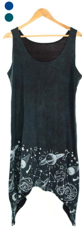
NP878 Celestial Design Dress £17.50