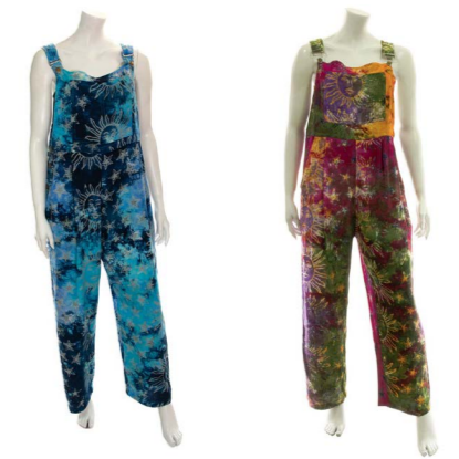
BA8029 - Dungarees £16.00