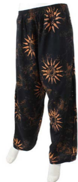
BTR5A-BKS Batik Trousers £11.00