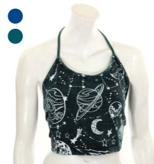
NP888 - Celestial Design Halter Neck Top £7.00