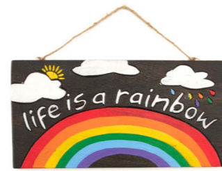
BA6082 Life Is A Rainbow £4.25