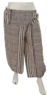
TH381 - Black and White Striped Trousers £9.50