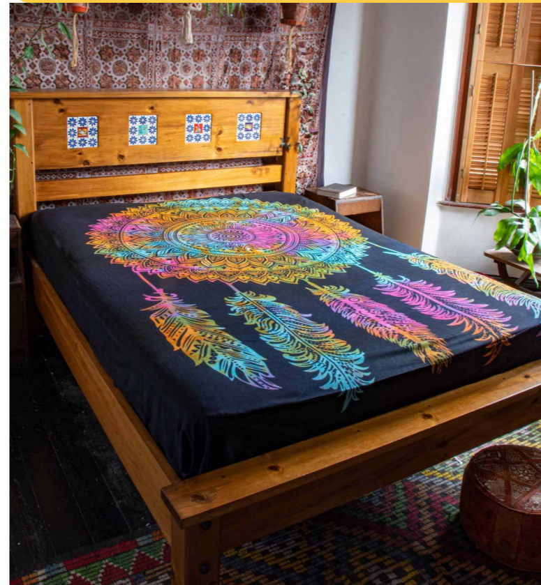
IN568 Dreamcatcher Bedspread £12.50