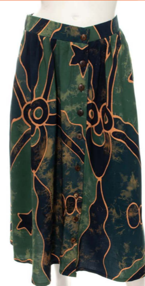
BA8050 - Button Skirt £12.50