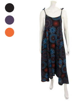
NP805 Cotton Strappy Dress £18.00