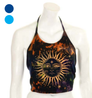
NP847 - Sun Design Halter Neck Top £7.00