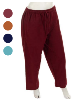
TH383 Thai Drawstring Trousers £9.50