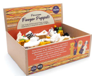
POS10 - Finger Puppets (quantity 75) £70.00

This is just a snapshot of what we have to offer.