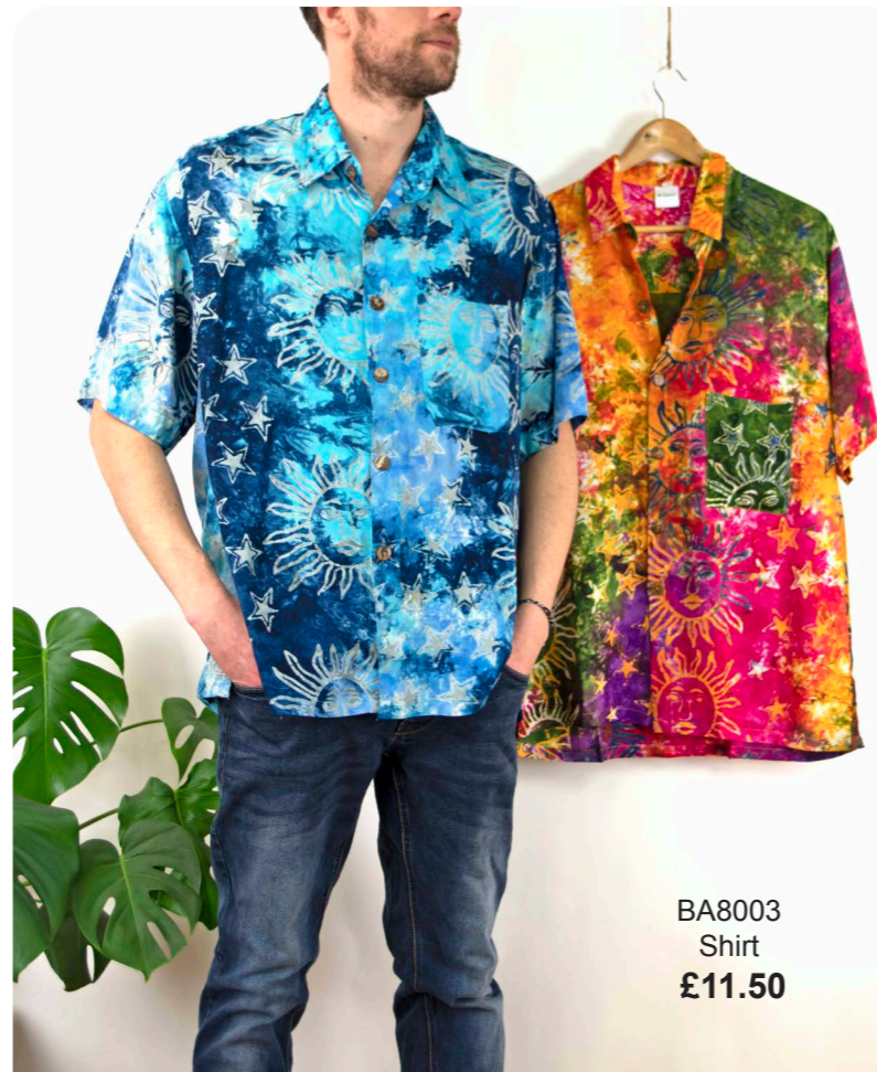
BA8003 Shirt £11.50