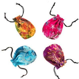
BA2191 Celestial Drawstring Pouch £1.10