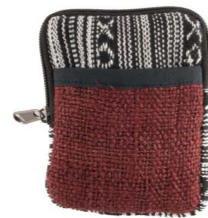
NP858 Hemp Belt Pouch £2.50