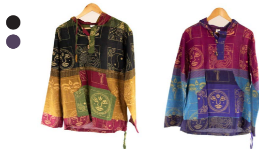
NP816 Symbols Hooded Smock £13.50