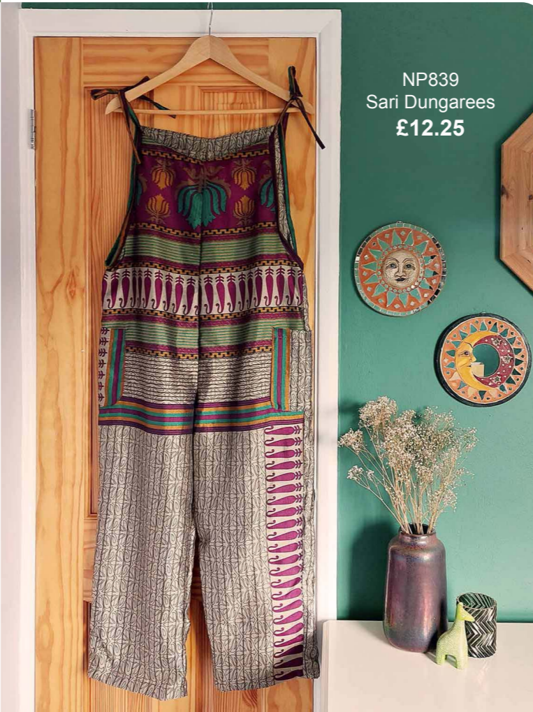
NP839 Sari Dungarees £12.25