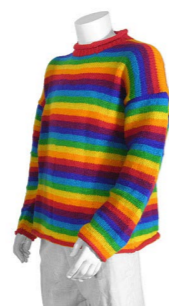
NW1 Woolen Rainbow Jumper £28.00