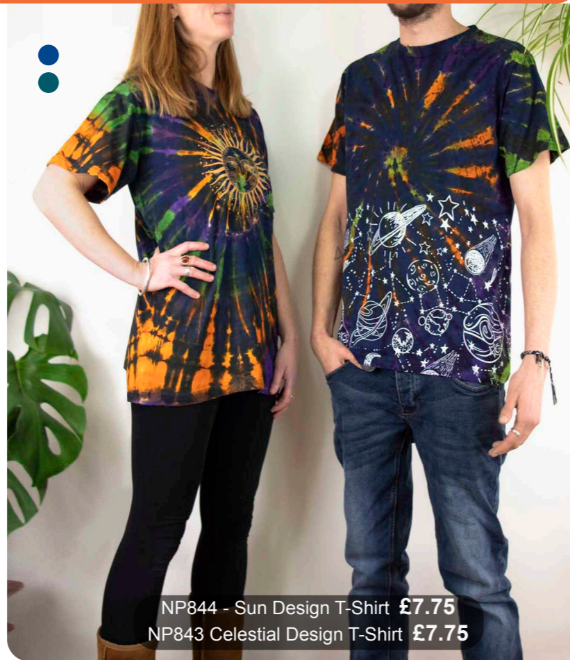
NP844 - Sun Design T-Shirt £7.75 NP843 Celestial Design T-Shirt £7.75