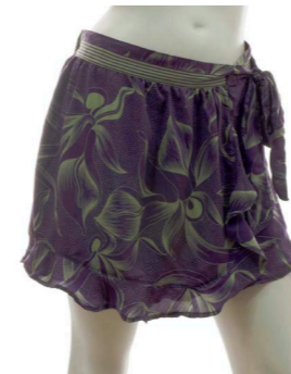
NP688 Sari Flap Shorts £8.00