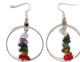
PE211 Chakra Hoop Earrings £2.75