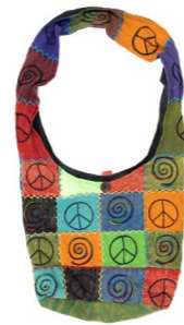
NP852 Peace Spiral Shoulder Bag £7.50