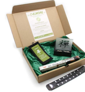
WPK002 - Wellbeing Calming Kit £8.00