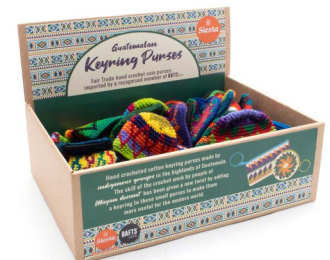
POS4 - Keyring Purses (quantity 48) £70.00