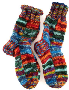
NP829 - Tie Dye Knitted Patchwork Socks £5.65