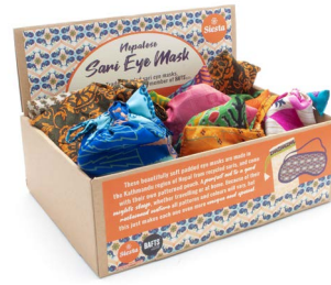
POS7 - Sari Eye Mask (quantity 30) £40.00