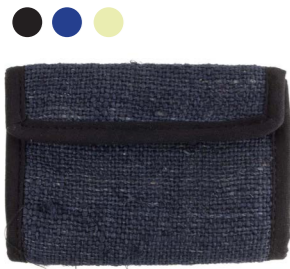
NP854 Hemp Wallet £3.50