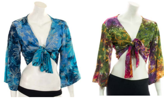
BA8038 - Wrap Top £10.00