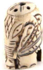
NP873 - Carved Bone Elephant Incense Holder £2.70