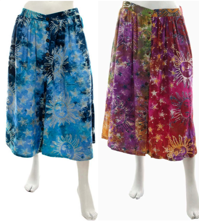
BA8025 - Button Skirt £12.50

Please note: codes for colour variations in the Celestial range are Blue (BCL) and Rainbow (BOW)