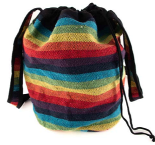
NP872 - Gheri Simple Drawstring Bag £4.00