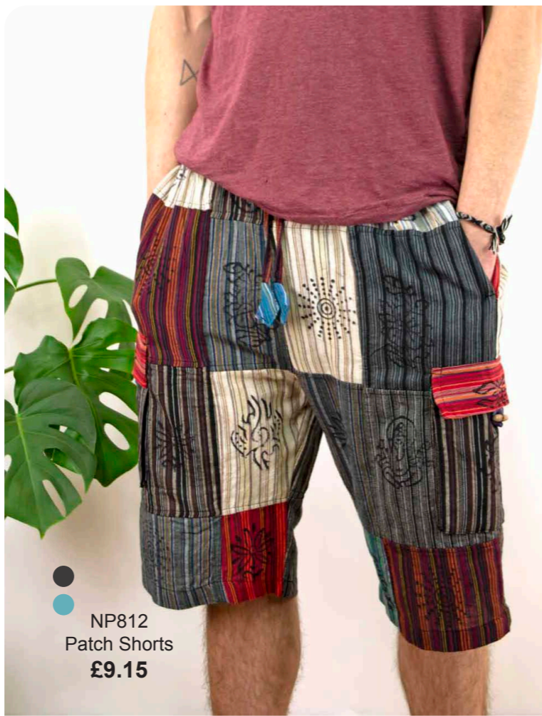
NP812 Patch Shorts £9.15