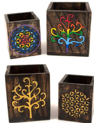
BA6076 / BA6077 Rainbow / Gold Tree and Flower Of Life Nesting Storage Boxes £5.50