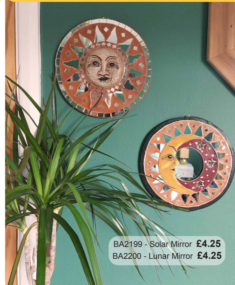
BA2199 - Solar Mirror £4.25 BA2200 - Lunar Mirror £4.25