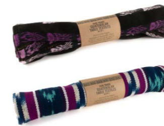
GU083 / GU084 Table Textiles £7.50