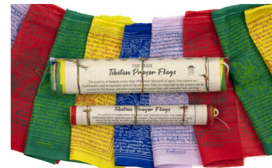
NP866 / NP867 Fair Trade Packed Tibetan Prayer Flags (Medium / Large) £1.75 / £4.15