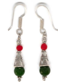
NP883 Tubular Earrings £2.50