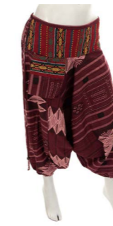
TH378 Thai Ali Baba Trousers (assorted colours) £10.00