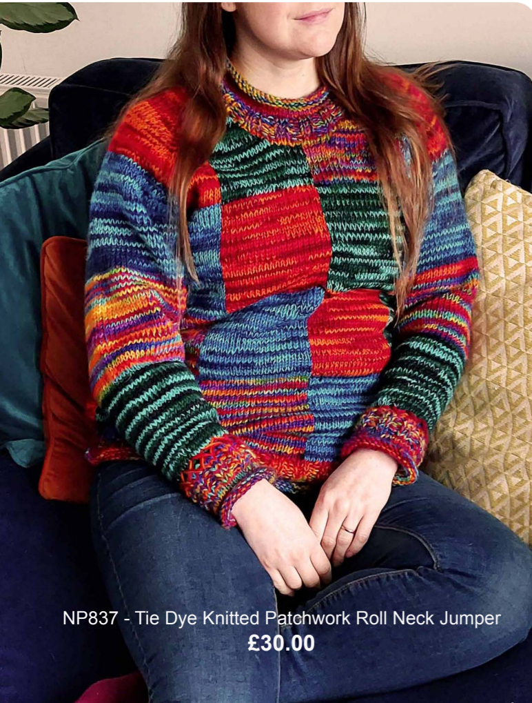
NP837 - Tie Dye Knitted Patchwork Roll Neck Jumper £30.00