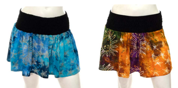
BA8046 - Mini Skirt £8.25