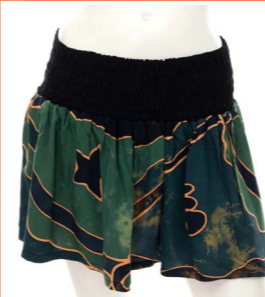
BA8047-ABS - Mini Skirt £8.25