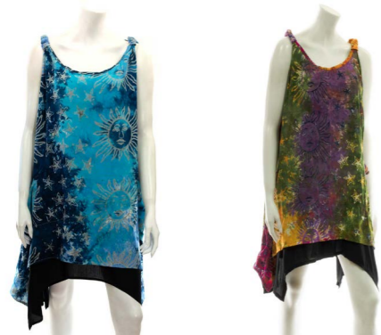
BA8030 - Pocket Dress £11.50