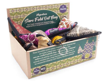
POS8 - Sari Fold Out Bag (quantity 20) £40.00