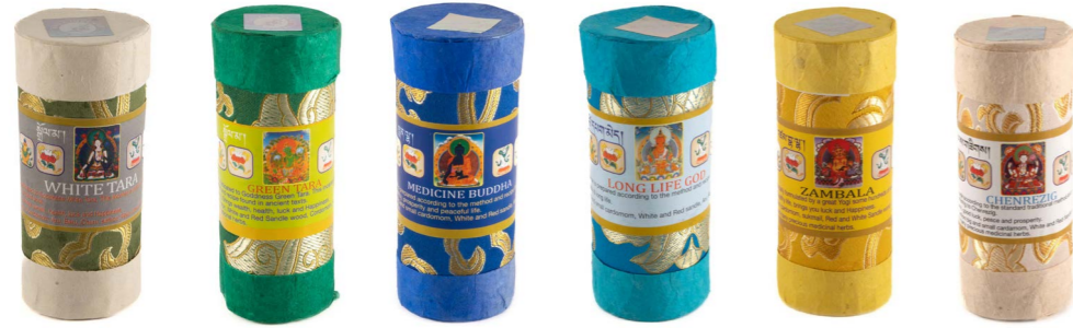
NP795 - NP800 Druk Bhutanese Incense Collection (6 fragrances) £1.65 each