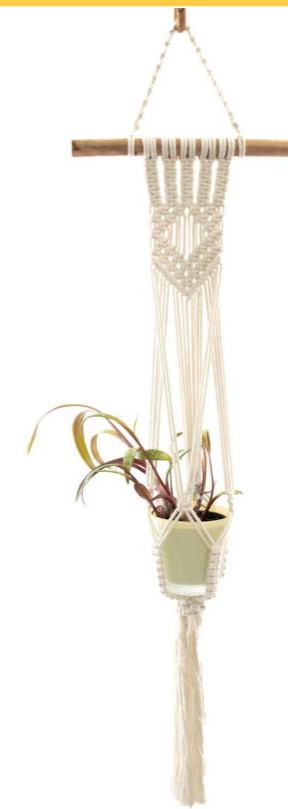
BA2201 - Wall Macrame Plant Hanger £5.00