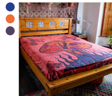
IN567 Toadstool Bedspread £12.50