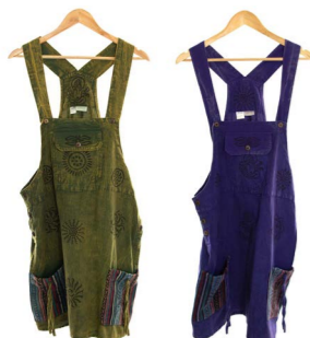
NP814 Stonewash Cargo Dress £13.50