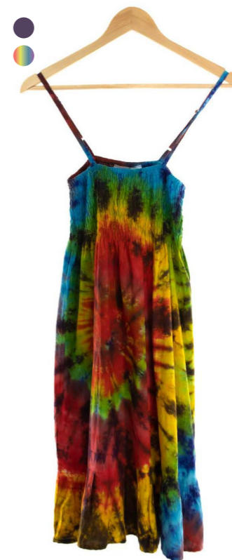
NP813 Tie Dye Strappy Dress £12.50