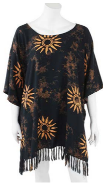
BTP2-BKS Short Batik Kaftan £11.00