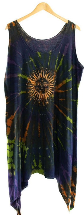
NP845 Sun Design Dress £17.50

Please note that some collections have already arrived whilst others are on their way and will be with us soon. Details are available on the website.