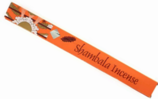
NP864 Shambala Incense £1.75