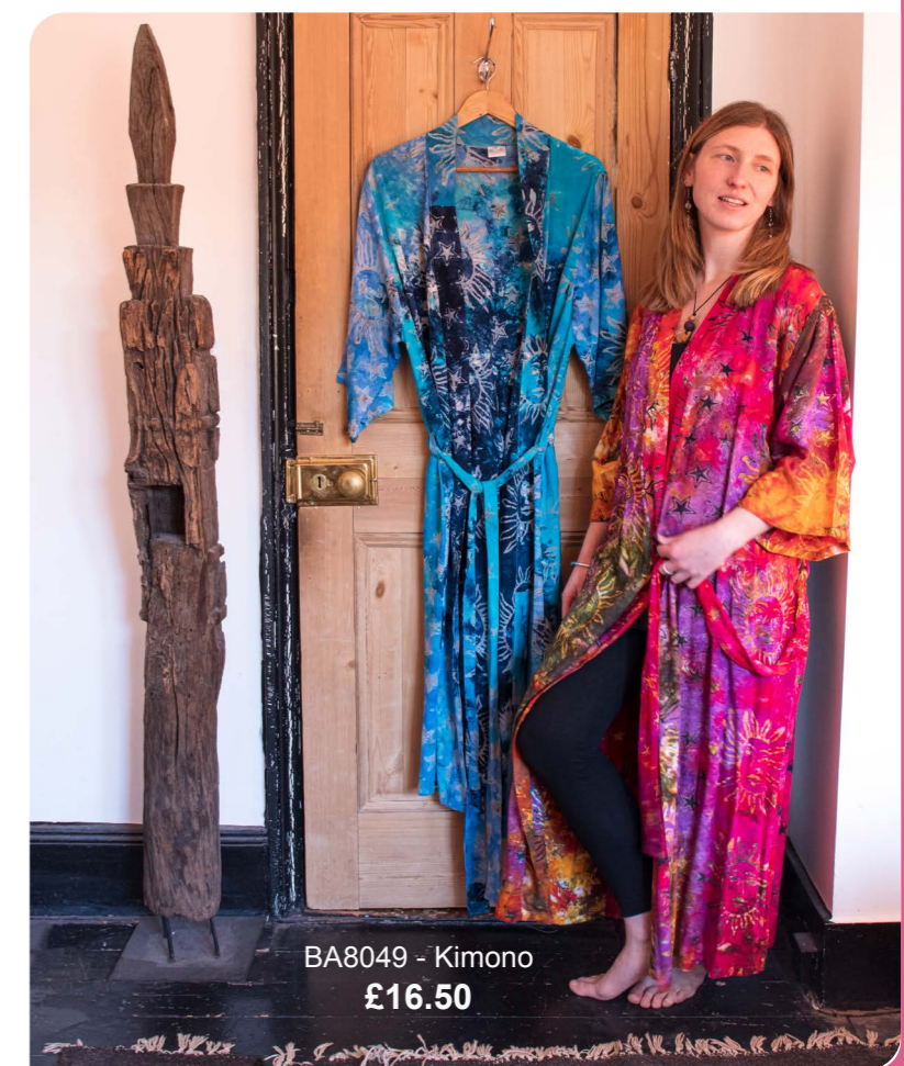
BA8049 - Kimono £16.50