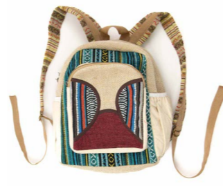
NP853 - Cotton, Nettle and Hemp Backpack £12.00