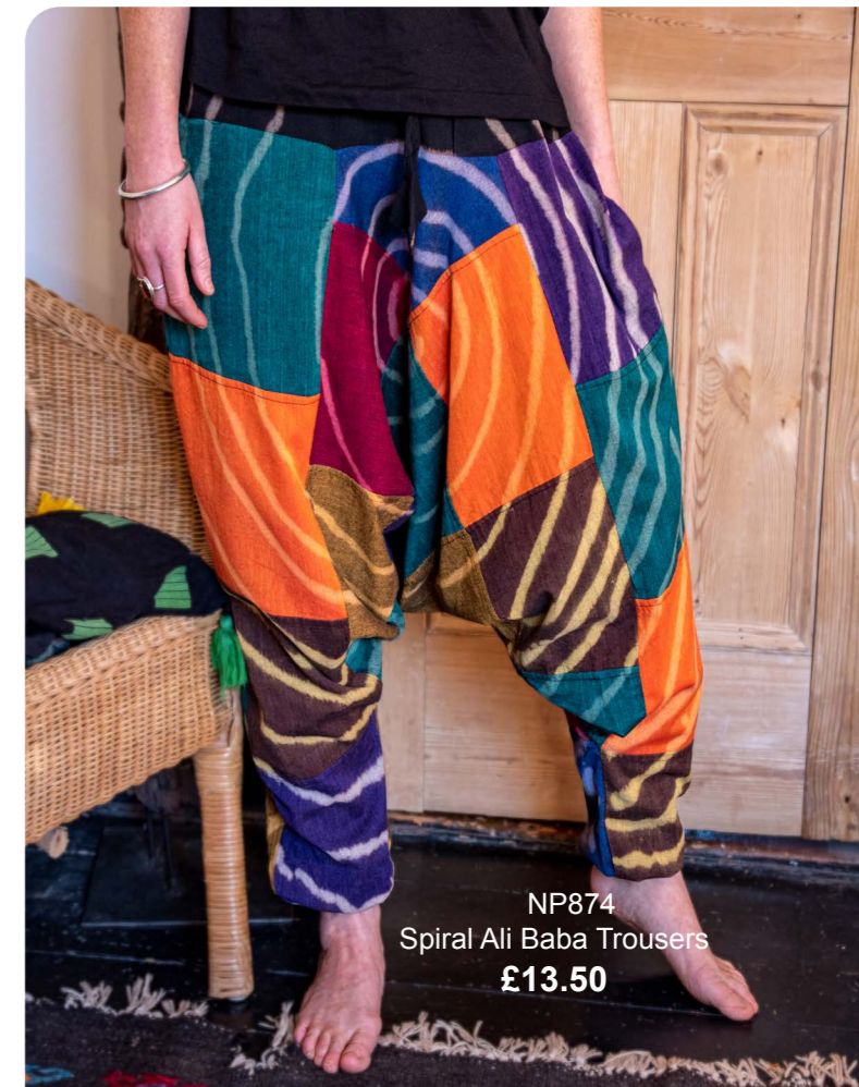
NP874 Spiral Ali Baba Trousers £13.50