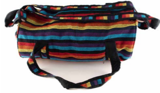
NP811 Gheri Sports Bag £15.50