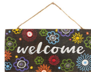
BA6083 Welcome Plaque £4.25